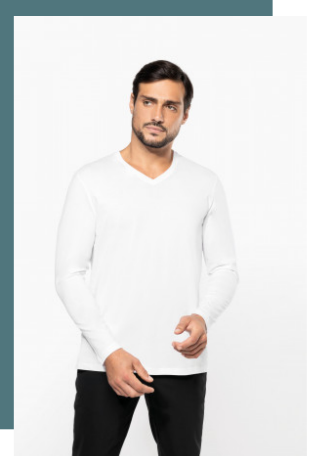
All rights reserved ©